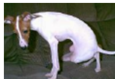
These dogs are all victims of the horrors of puppy mills. With your help, this can be stopped!

Find out more information or sign up to help at: